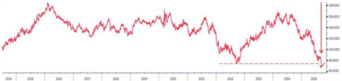
Exhibit 3. QUAL Relative to the S&P 500

Meanwhile, companies with quality and value characteristics have meaningfully underperformed. QUAL, the largest ETF focused on investing in high quality stocks, made a new all-time low relative to the S&P 500 during the quarter as investors move away from high quality companies, another indicator of greater risk seeking behavior.